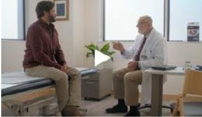
("What is Inspire therapy" video)

Inspire therapy is a mask-free 1 solution for people with obstructive sleep apnea (OSA) who have tried and struggled with CPAP. Through a simple-to-use system including the Inspire® implant, Inspire™ remote and Inspire® app, Inspire therapy enables you to control your OSA treatment from the palm of your hand.